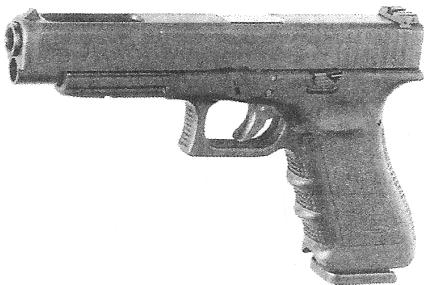
Glock large frame auto-pistol Reliable firepower with high capacity magazines

The debate goes on between the advocates of 9mm and 40 and 45 caliber handguns. The thing to know is that a handgun is an inherently inaccurate weapon. Even the police score only 10-20% hits in real combat. These weapons are to stop immediate threats in the 10 to 50 foot range and drive away identified threats out to a few hundred feet. You will want to have a high capacity automatic with extra magazines. Revolvers are great "bed side drawer" and under the car seat guns because of their reliability, but they are a bit bulky and slow to reload. Glock auto pistols have a well-deserved reputation for reliability and durability under rough conditions. Made for combat, they have no safety. They come in a wide variety of sizes and calibers from 9mm through 45 calibers and magazine capacities ranging from 10-17 rounds. If you prefer a more conventional weapon with visible hammers and safeties. Colt, Browning, Beretta , H&K, and SIG all make fine choices.